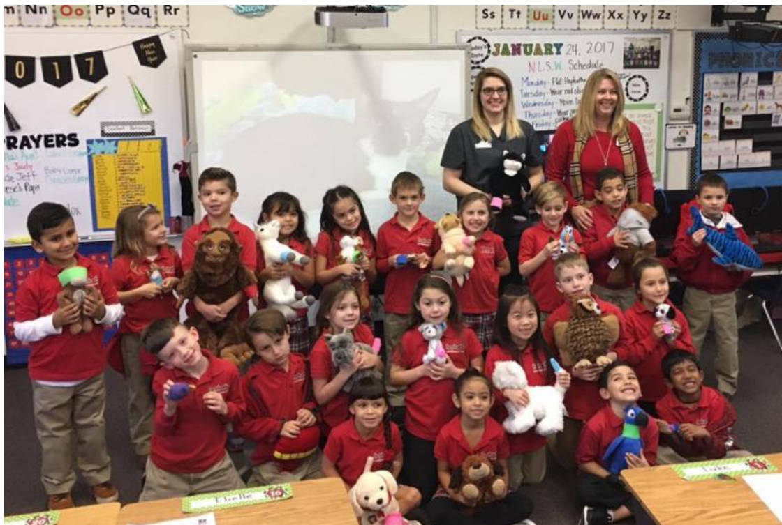
1st graders at Hephatha, Anaheim, CA , had a visit from a veterinarian!