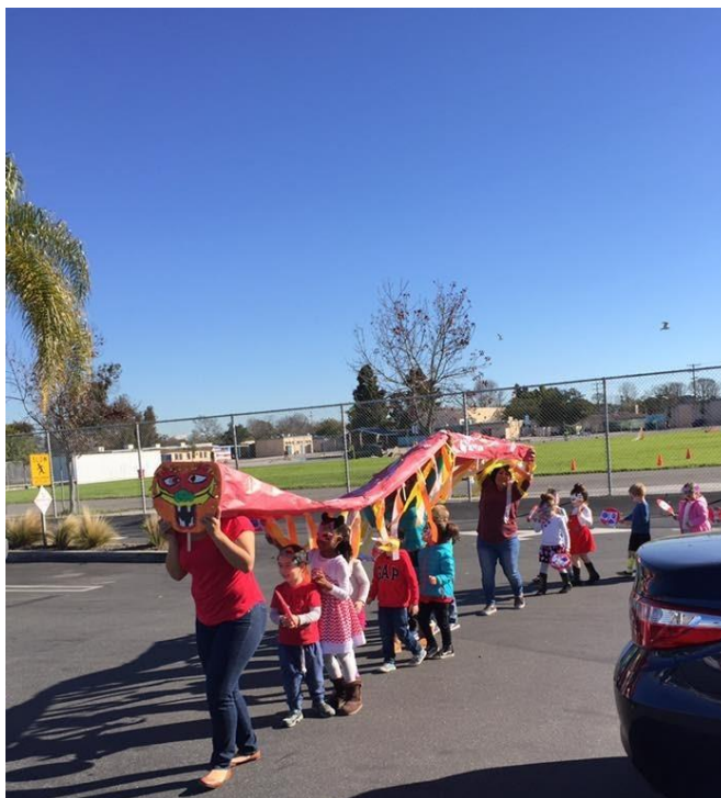
Children of Our Savior Lutheran Preschool, Westchester, CA, held a Chinese New Year parade during NLSW!

Next year's NLSW dates are January 21-27, 2018 . The theme is It's Still All About Jesus!