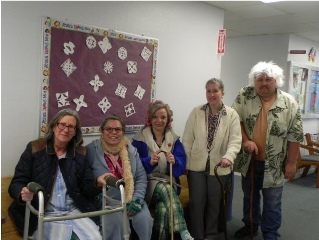
Pictured above are teachers from Zion, Victorville, CA , during NLSW on Future Day. Students and teachers dressed as they will be in the future--and these teachers didn't plan this in advance!