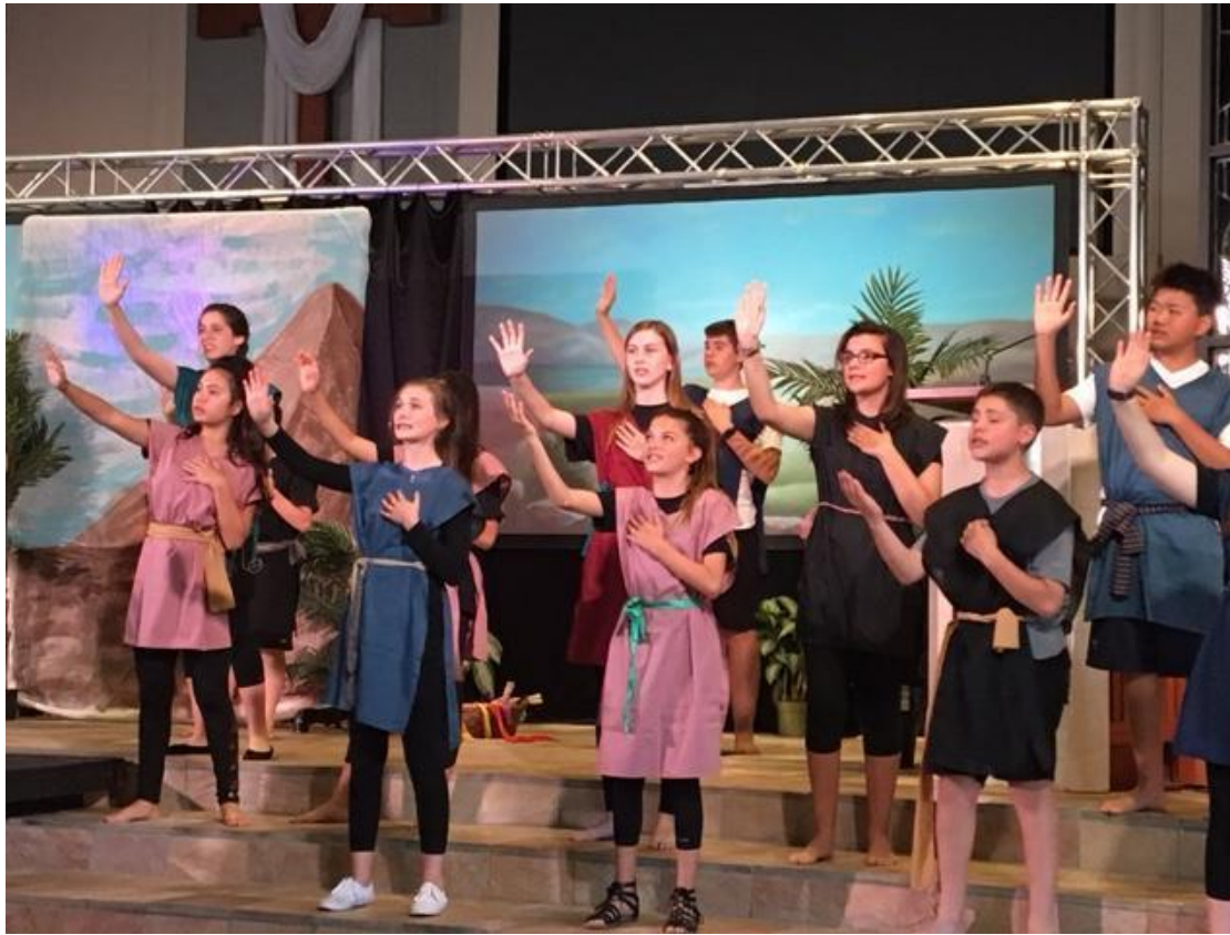
Middle school students at Christ Lutheran School, Costa Mesa, CA , recently performed in their annual school musical.