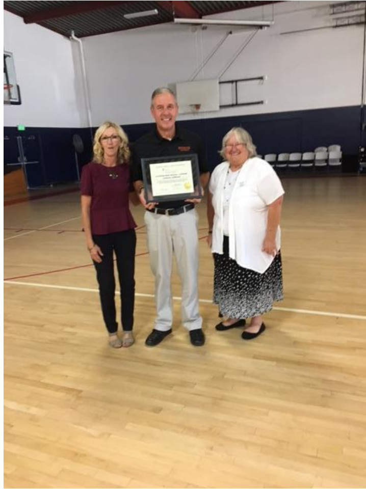
Teacher installation was a joyous event at Children of our Savior Lutheran Preschool, Westchester, CA.